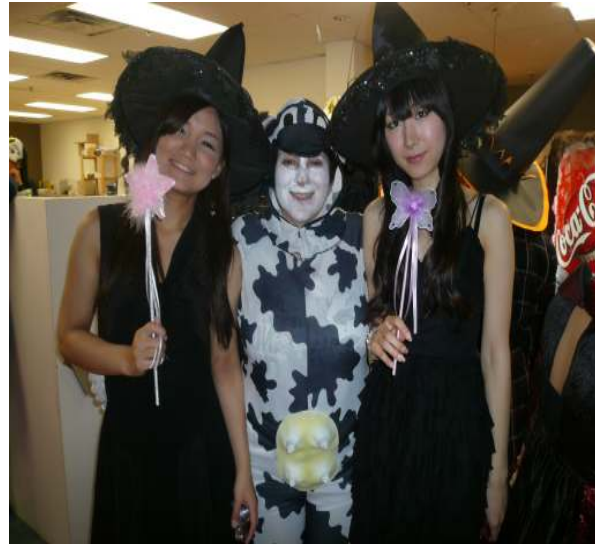
Everyone had a wonderful time at the Halloween party!! All the teachers and students dressed in wonderful costumes