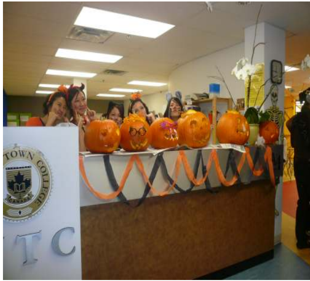
Wow!! Look at all the Wonderful pumpkins :) Congratulations to the winners of the pumpkin carving contest