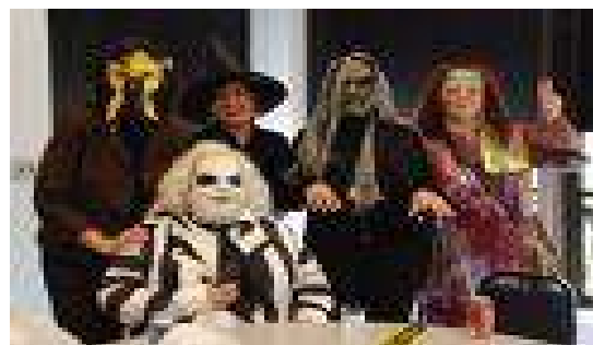
"It has become a day of fun for people of all ages."